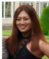
VICE-PRESIDENT-ELECT Leanne Chen